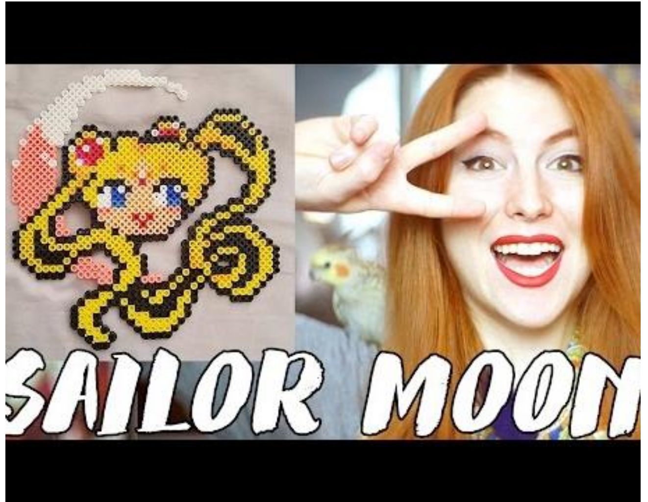
Video from Snarled on YouTube

I love using mixed media, so finding another artist who used mixed media was very exciting from me!