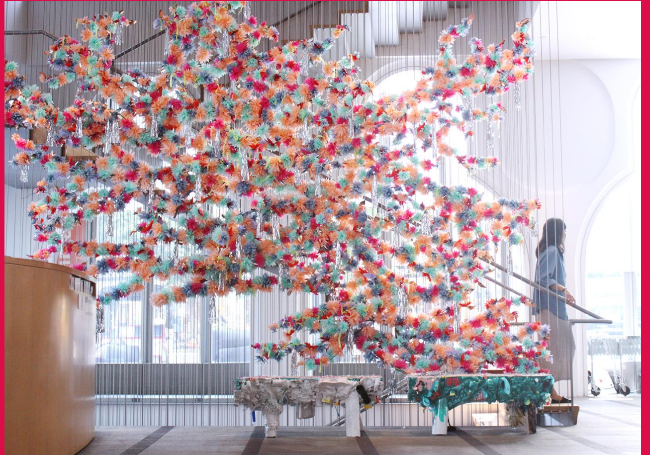
Site specific installation for NYC Makers , The Museum of Arts and Design Biennial exhibition, New York 2014