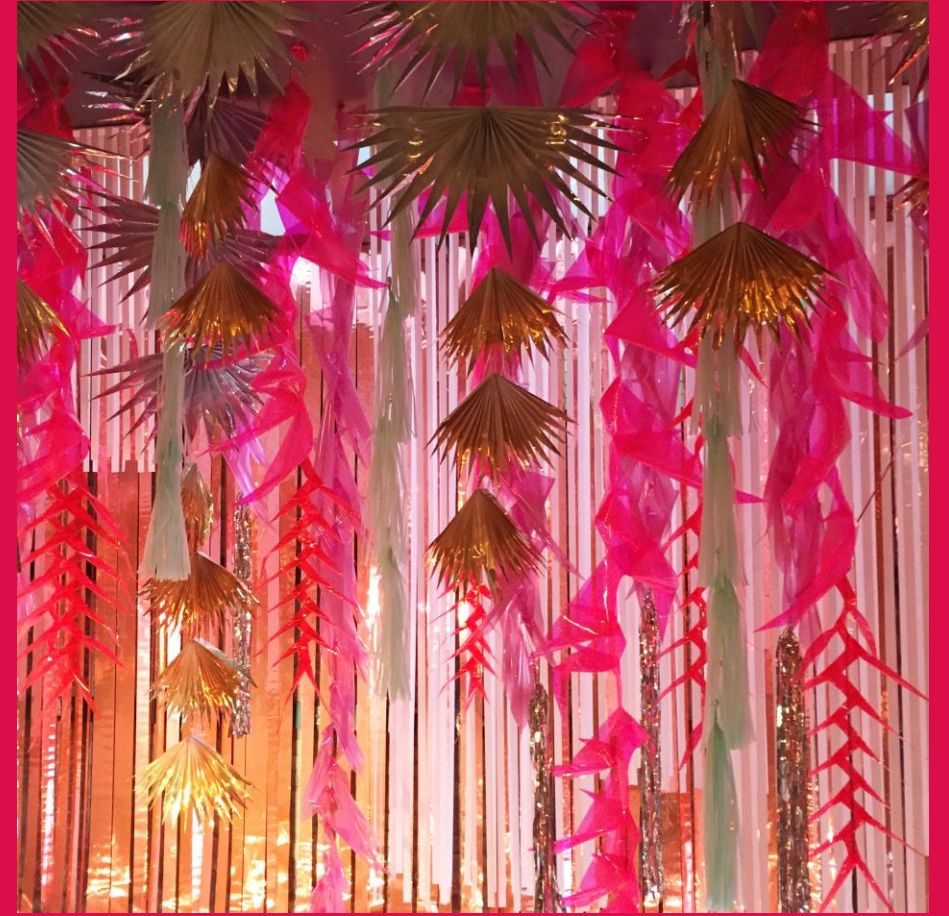
Site Specific Installation For Mission Chinese. New York. January 2016